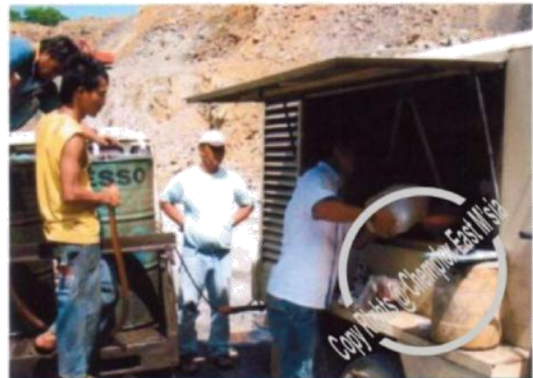
MEASURING SIZE OF FUEL TANK: TOPING UP OF 10lit DIESEL UNTIL FULL