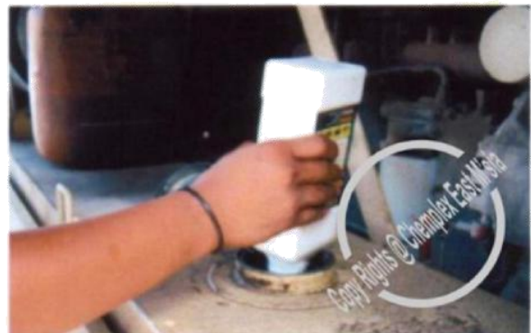
CHEMPLEX TREATMENT CHEMPLEX "SUPERTECH" 1Lit::1,000Lit