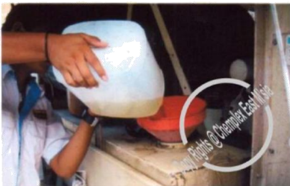
SIZE OF GENSET FUEL TANK: FULL TANK= 65 cm (329 Lit)