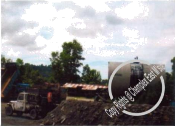
SITE MAIN TANK 'DIESEL'