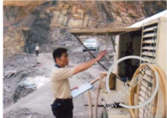
BEFORE TREATMENT: BASELINE AVG DIESEL USED: 23.38Lit Per Hr