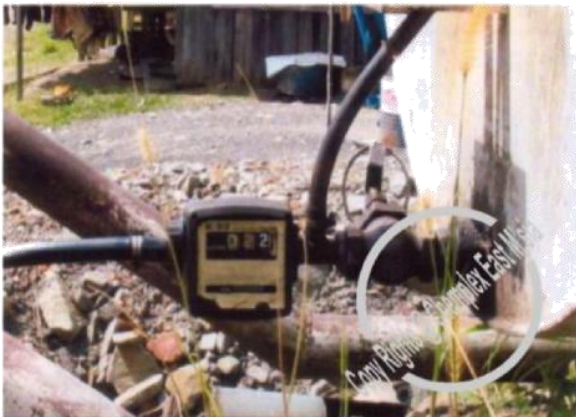
MAIN FUEL TANK: FLOW RATE METER IN LITRE.